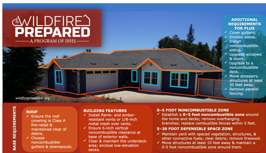
Figure 1. Abbreviated List of Requirements

Two designations are available. To earn a designation, a home shall meet all the requirements for the chosen designation level, as evaluated by an authorized third-party, and verified by IBHS. The Plus level builds upon the Base level requirements. See Figure 1.