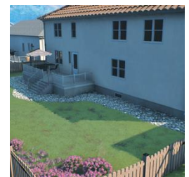
Embers blown from miles away can easily start spot fires around your home. Creating and maintaining defensible space on your property will slow the spread of fire and reduce flame intensity near your home. By spacing out bushes and trees, you are removing ladder fuels that allow fire to spread and reducing the intensity of a fire near your home.

Note: Best practice is to place structures 30+ feet away from your home. To meet the Plus level designation, it is required to have all structures placed at least 30 feet from the home.