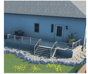
For low decks, enclose the area underneath to keep debris and embers out which can easily ignite a deck from underneath.