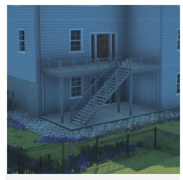
Decks attached to or built near your home provide a path for fire to reach your home. Reducing or eliminating the vulnerabilities of a deck or porch—including items on top of or underneath—reduces the chance your home ignites.