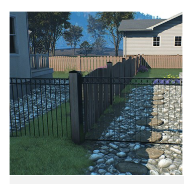
Combustible fences when ignited can provide a pathway for fire to reach your home.

□ Replace plastic or vinyl gutters with metal gutters such as aluminum or steel.