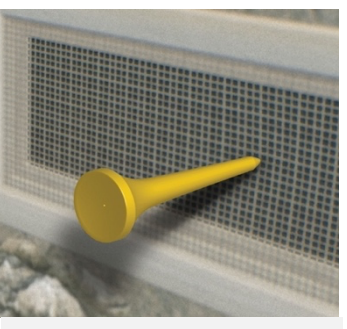
Wind-blown embers can enter your home through vents in your attic, roof, gables, and crawlspace and ignite materials inside.